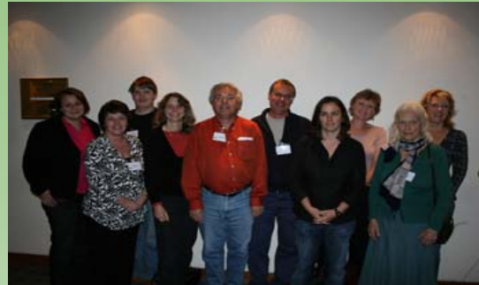
Herefordshire with Mi enterprise