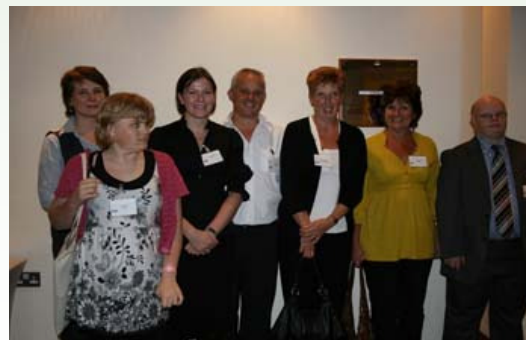
ROC with Torbay