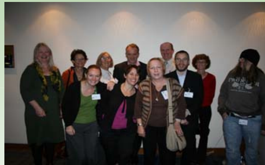
South East with Kent and Medway